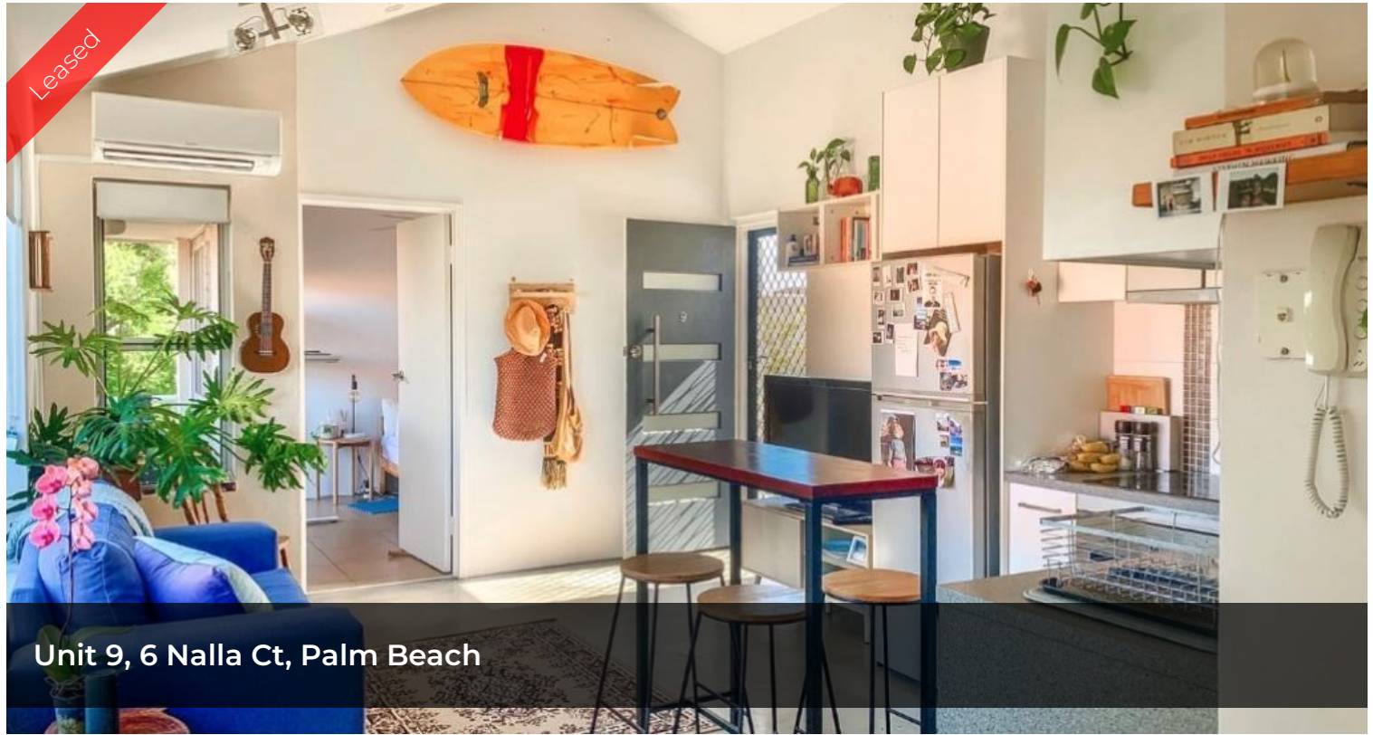
Unit 9, 6 Nalla Ct, Palm Beach