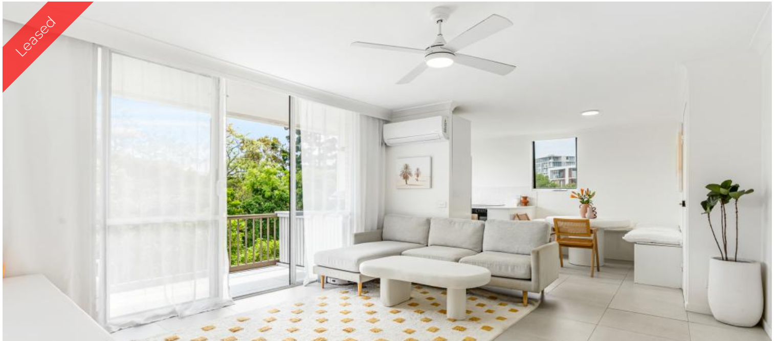
Unit 9, 8 Mawarra St, Palm Beach